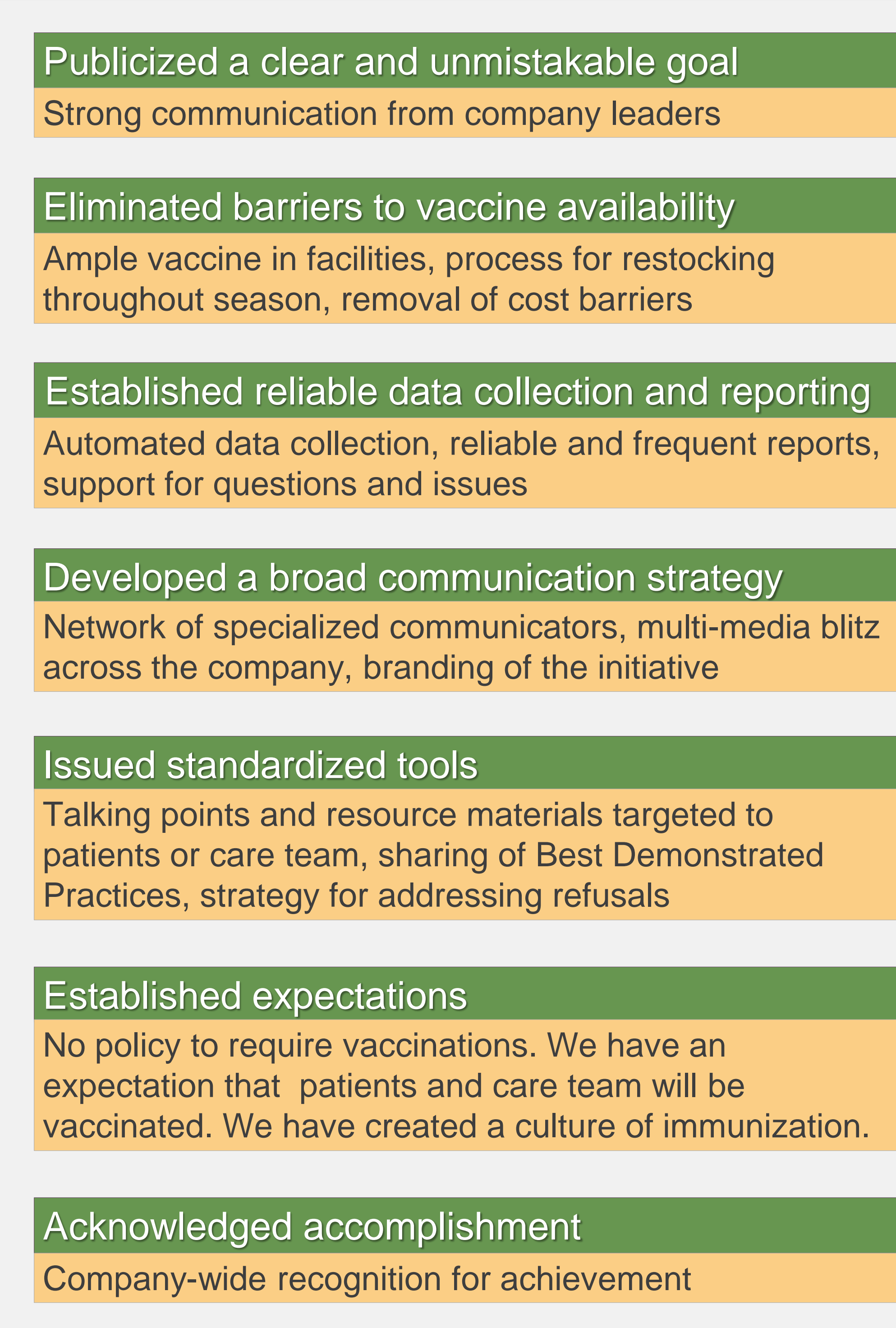
Figure 1. Comprehensive System of Immunization