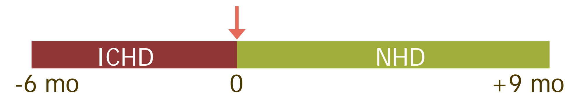
Figure 1. Methodology: Conversion from ICHD to NHD